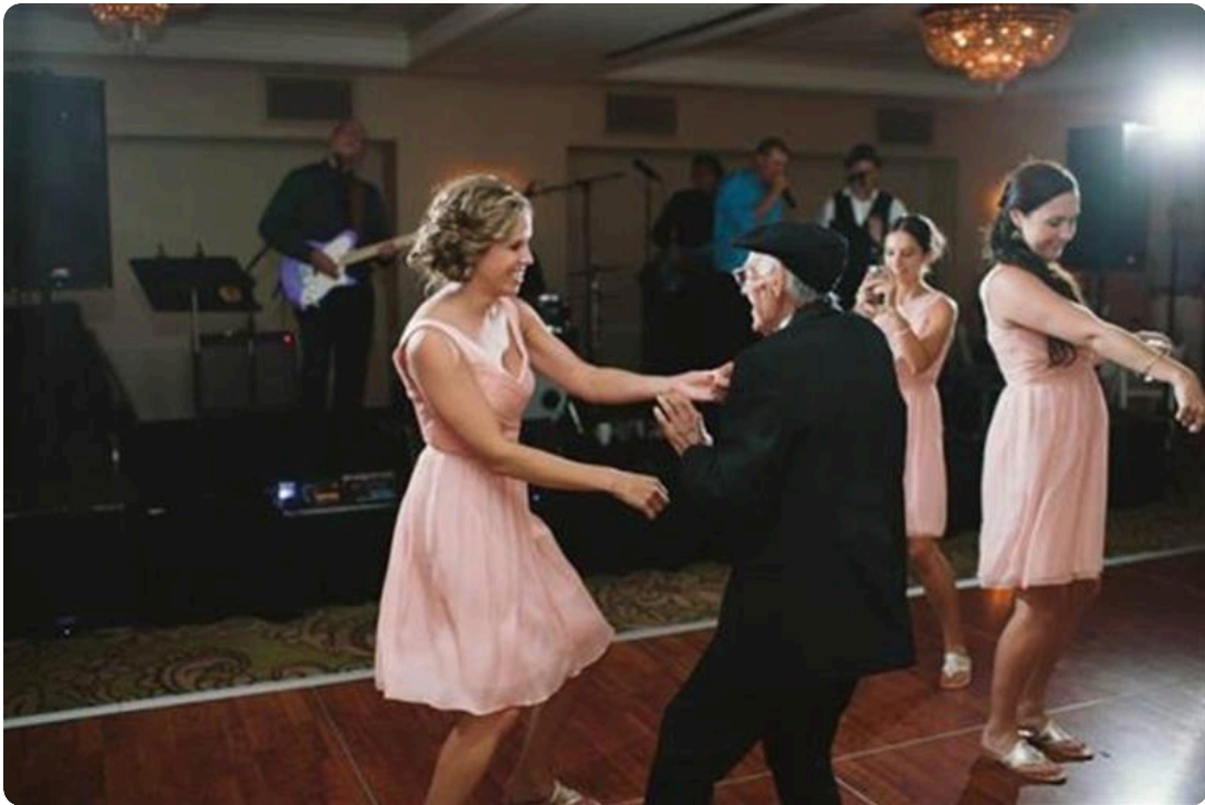
BR Brenda January 18 at 5:46 AM Love this! PopPaw in true form!!!